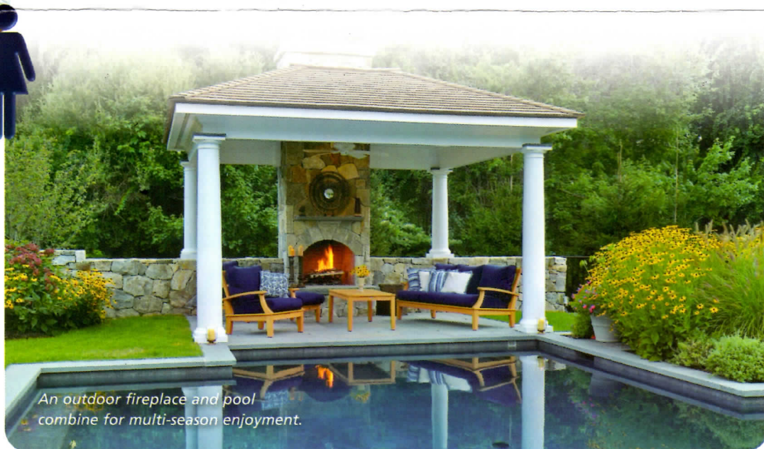
An outdoor fireplace and pool combine for multi-season enjoyment.

Carefully planned and professionally installed, an outdoor fireplace is sure to become a popular "hot spot" on your property. Enjoy!